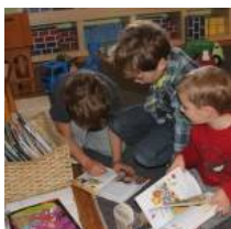
Heartbreak and preschool applications: Welcome to the East Bay! (Community Voices)