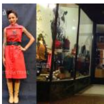
Dispatches from City Council: Virtual inspections, micro-lending and the business of innovation (Community Voices)