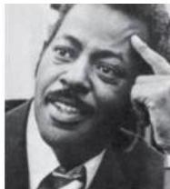
Oakland cartoon legend Morrie Turner dies (Community Voices)